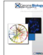
Table of contents Volume listing

The complete issue of Genome Biology Volume 14 Issue 3 is now available.